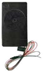
X1WK Mobile wireless charger