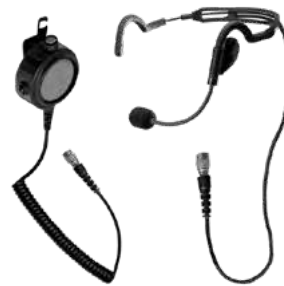
WPHFH-X10 Headset Industrial lightweight