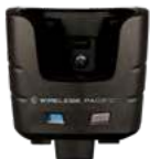
XMVC mobile charger Included with XEX2