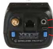
base view X10W Gateway