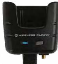
X10DR Elite Plus Standard Gateway