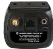
base view Std Gateway