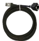
XEC-4.5 4.5 meter Extension interface cable. Order when the radio is trunk mounted. Connects to supplied XIC-1.5 interface cable.(optional)