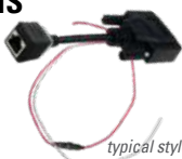
1 x XCA-** Radio adaptor (Required but NOT included) ** refer pricelist for currently available radio adaptors