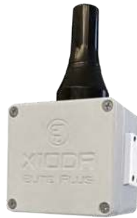
X10DR Elite Plus Rooftop Gateway