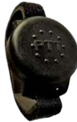
X10DR XWPB Wireless PTT Button