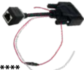
XCA-**** Radio Adaptor Refer price book (typical style)