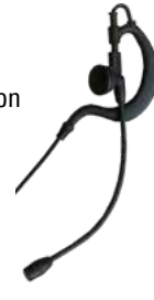
WPULH-X10 Headset Ultra-lightweight earhook style