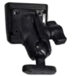
XMDM2 Mobile charger mounting arm