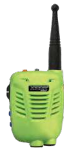
XFCF Custom Front Cover option