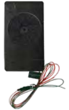
X1WK Mobile wireless charger