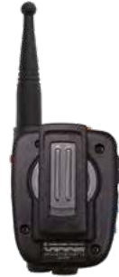
XLMC Standard long rotary shoulder mount clip