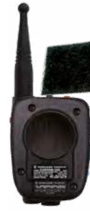
XVMC Velcro® shoulder mount option includes Velcro patch - for best shoulder placement