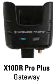
X10DR Pro Plus Gateway