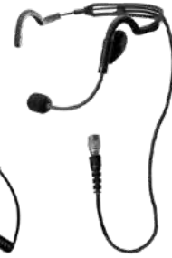
WPHFH-X10 Headset Industrial lightweight