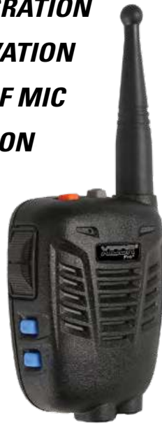
X10DR Pro Plus Handset