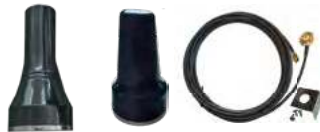
XMPA multipolarity roof/rack mount antenna kit