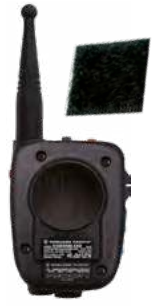
XWMC Velcro® wireless charging mount option includes Velcro patch - for best shoulder placement